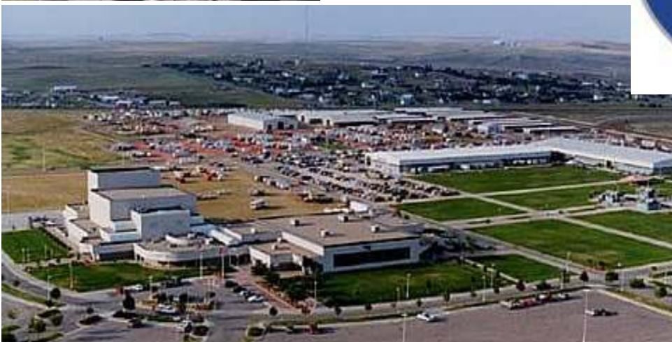
The CAM-PLEX, Gillette, WY