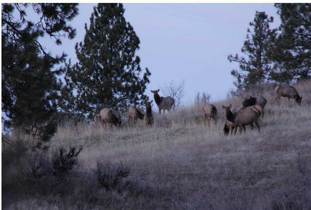
Garden Valley, Idaho January 2012 (What are you looking at?)

Here it is—the middle of January and the weather taunts that it is time to hook up to our home-away-from-home and hit the road. Honestly the weather, at least locally, isn't really conducive for camping unless you are really adventurous (and don't mind the risk of freezing pipes..etc.) The next best thing, hang out in the trailer and muse about the things we want to do to/with the trailer once the weather gets warm. The batteries needed to be topped off so fired up the generator, fired up the catalytic heater (it is still winter) and relaxed. The worst thing about that type of session is the wish list gets really, really long (and expensive) and you can think lots of things you want to experience when the time comes. Well the spring plan is now underway and ready to be executed. Meanwhile I guess we'll limit our trips